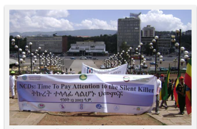
Photo: A mass walk organized by the Consortium of Ethiopian NCD Associations in Addis Ababa to raise awareness of NCDs

As a result of CENDA's continued advocacy efforts, the Federal Ministry of Health approved . the Strategic Framework to be included in the Fourth Health Sector Development Program and Growth and Transformation Plan (GTP) of Ethiopia for 2011-2015. This was a major achievement. Up until then,