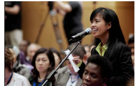
Participants from across the globe were engaged at the Global Forum on Cervical Cancer Prevention in June 2013, co-sponsored by CCA.

Even before the official launch of the coalition, the CCA partners implemented a global campaign to raise awareness and build civil society support for access to cervical cancer prevention. The Global Call to Stop Cervical Cancer was announced at the World YWCA meeting in Nairobi in July 2007; the campaign there gathered more than 1,200 signatories from over 140 countries. CCA subsequently fostered grassroots momentum for change and expanded support for improved cervical cancer prevention at the highest levels of governments and international agencies. For example, at the request of the World Health Organization (WHO) and the GAVI Alliance, CCA compiled more than 300 support letters, op-eds, and other communications from ministers of health and global health leaders. This “Dossier of Support” was presented to key decision-makers at WHO, GAVI, and other organizations as evidence of the global demand for strengthening efforts to prevent cervical cancer. The dossier is available at www.rho.org/CCAdossier.htm .