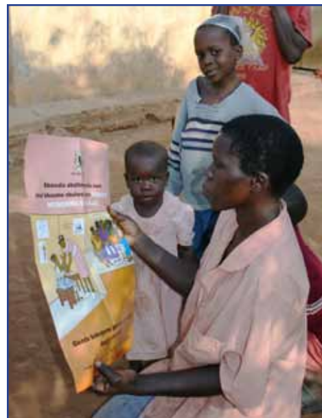
A mother reviews an educational poster about HPV vaccination with her daughters.

This project found that vaccine acceptability among different stakeholders changed over time, from, in some cases, initial reluctance or unwillingness to participate in vaccination to willingness and even enthusiasm. Parents reported that they were initially reluctant to have their daughters vaccinated because they did not know about cervical cancer or understand the purpose of the HPV vaccines. As they learned more, they became less reluctant. Giving parents time to understand and accept the information was therefore a beneficial strategy. Parents of many girls who were fully vaccinated reported that they had received information about HPV vaccination more than one month prior to the vaccination session. In some cases, parents noted that this enabled them to go to schools and seek clarifications if the initial information they heard was unclear. By contrast, lower coverage seemed to occur in places where