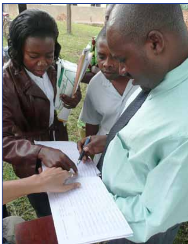
Members of the HPV vaccination team review vaccination logbooks as part of a monitoring visit at Ibanda Kyarukumba Primary School.

Intensive monitoring and evaluation was conducted as part of the HPV vaccination program, guided by a comprehensive monitoring and supportive supervision plan developed during initial program planning and training. Regular and targeted supervision visits by the Ministry of Health and district health teams helped make health providers feel more supported and accountable for performing key tasks. For example, supportive supervision involved helping health workers understand that collection of accurate and complete data would be critical to planning subsequent vaccination activities. In general, health workers stated that in places where monitoring and supportive supervision were more intense and frequent, significant effort was invested in ensuring that all eligible girls were identified, vaccinated, or followed up.