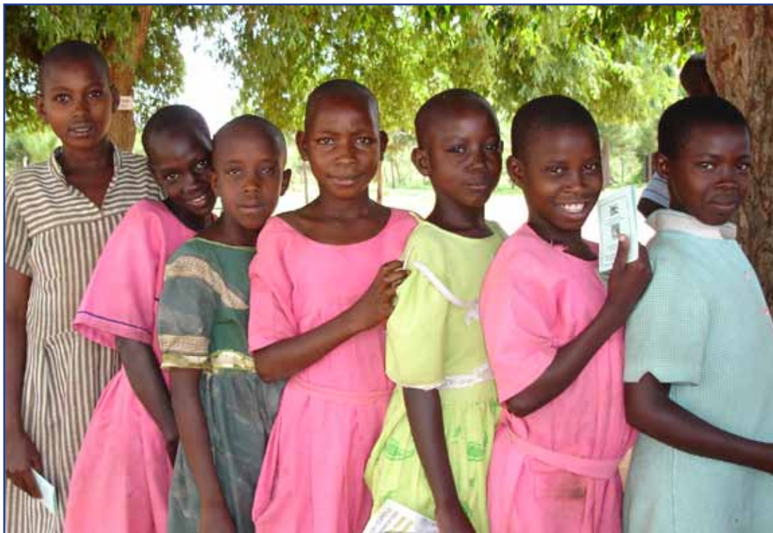
Primary school girls wait to receive HPV vaccinations, as part of a demonstration project implemented by the government of Uganda with technical support from PATH.