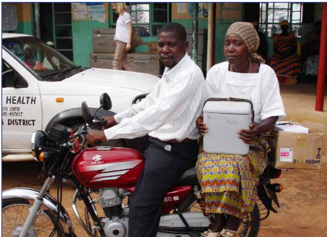
Health workers transport HPV vaccines to a vaccination site.

District officials in Ibanda reported that joint planning increased effectiveness of community mobilization and sensitization prior to vaccination. Involvement by health workers, community leaders, teachers, and parents in the same meetings helped eliminate the possibility of