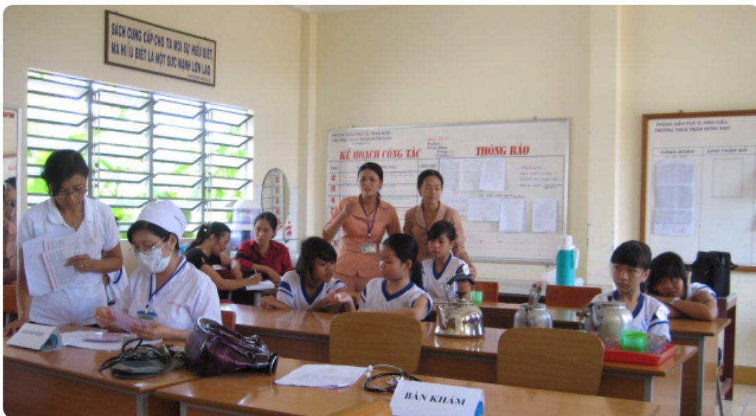
HPV vaccine program in Can Tho City school.

Specific training materials can be helpful for different audiences; for example, for training of physicians, scientific information can be provided about cervical screening and the HPV vaccine. Country-specific information about cervical cancer can help health workers clearly understand the threat in local communities.