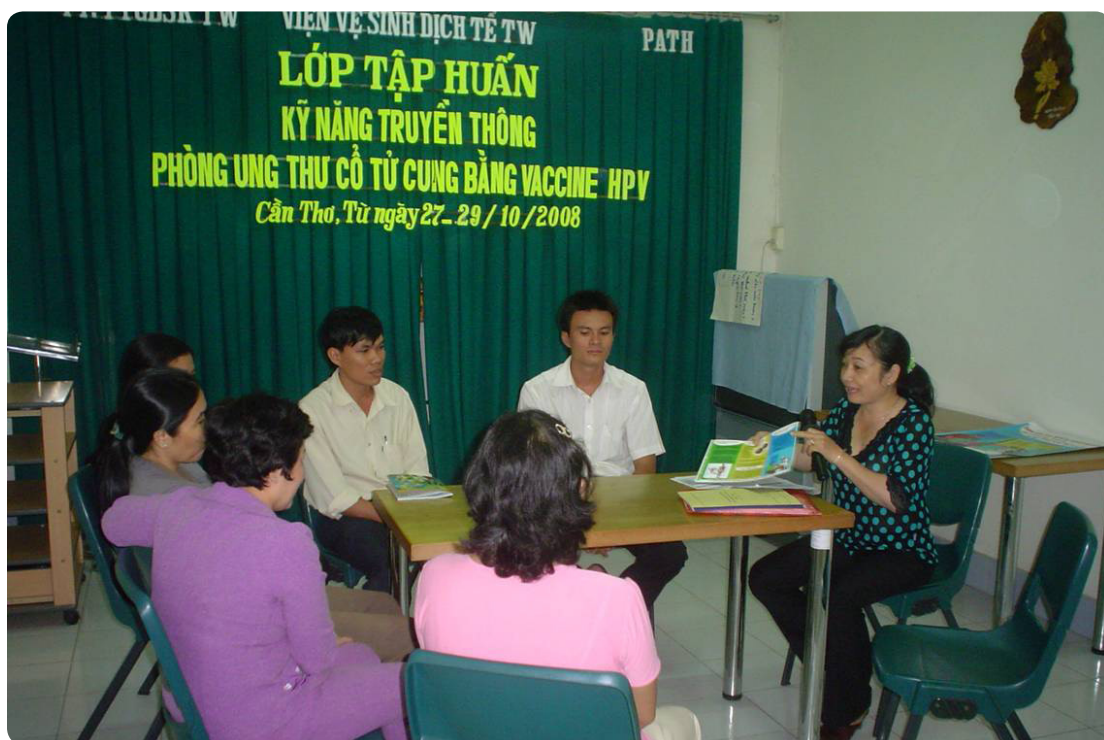
Community leaders discuss communication materials.

The demonstration vaccination program in Vietnam was planned and implemented by NIHE and NCHEC in partnership with PATH, and this government involvement created trust and fostered participation by families. NIHE has a reputation for high standards and rigor, which contributes to a positive attitude in the population toward vaccination in general. Involving influential government stakeholders in a visible fashion encouraged people to participate, and parents felt reassured when they saw that HPV vaccine, like other vaccines, was being delivered by ministry of health staff and that informational materials carried ministry of health logos.