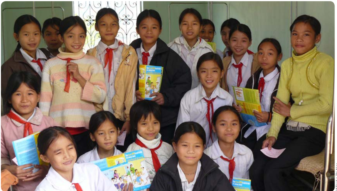
School girls with pamphlets about HPV vaccination.

Understanding detailed biological information about HPV infections and how they can lead to cervical cancer may be difficult for some audiences, especially those without formal education. However, families everywhere have some experience with cancer and are more likely to understand a simpler message about a vaccine that can help to prevent a type of cancer.