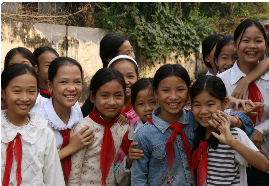
School girls in Hoa Binh, Vietnam.