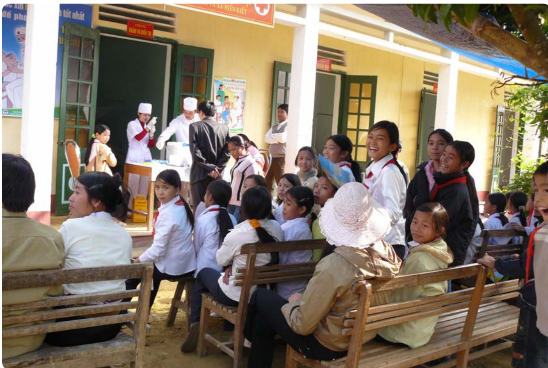
HPV vaccination in Nong Cong district school.

Since both strategies are feasible and can yield potentially high coverage rates, the choice of strategy for HPV vaccination in Vietnam or other countries with similar health and school systems can be based on factors that will optimize the use of available resources.