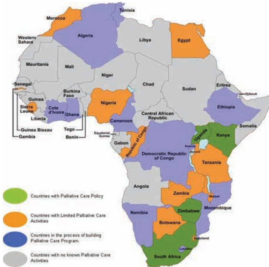
FIG 2. Access to palliative care in Africa (APCA Palliative Care Survey 2007) [44].