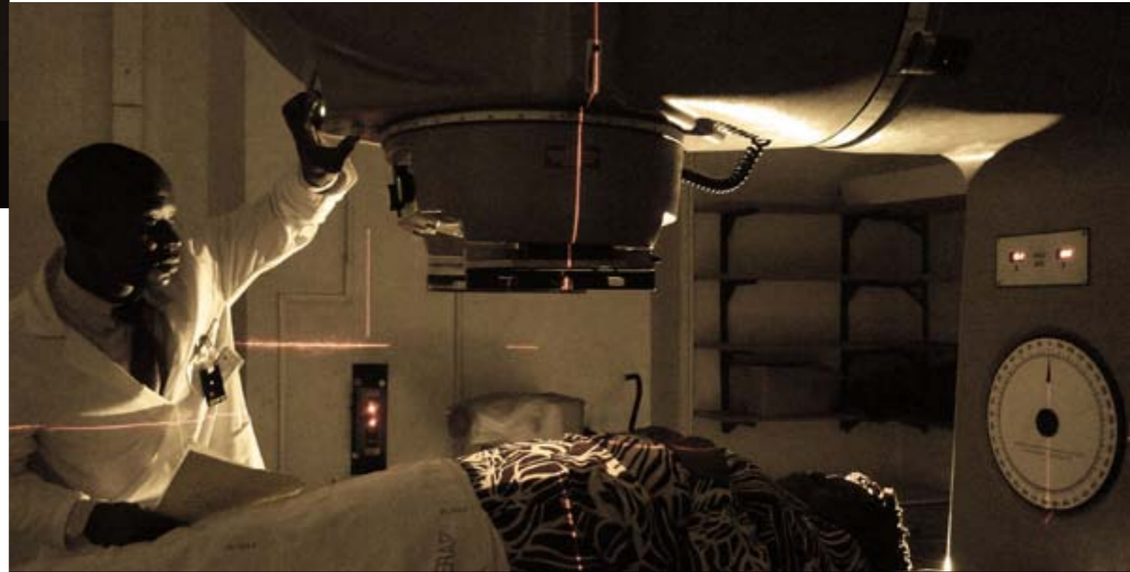
A radiation therapy technician prepares to administer a dose of radiotherapy. In the developed world, between 50% and 60% of patients diagnosed with cancer will receive radiotherapy at some point during their treatment. In low and middle income countries, only 20% of patients receive the radiotherapy treatment that they require.

The project, funded by the Roche African Research Foundation, the US Government and the IAEA, is focusing, initially, on four Member States that represent the English-speaking component of VUCCnet-Africa: Ghana, Uganda, United Republic of Tanzania and Zambia . It is expected to initiate a French-speaking segment of the project as soon as additional funding becomes available.