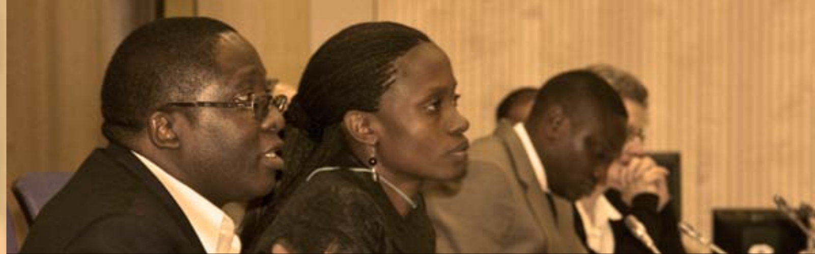
Panel discussion on the regional approach to “Standards, Accreditation & Recognition” at the 2011 VUCCnet Africa: Annual Stakeholders’ Project Coordination Meeting at IAEA headquarters in Vienna.

Today, in Ghana, Tanzania, Uganda and Zambia, a cancer diagnosis is nearly a death sentence; with close to 78% of those diagnosed losing their battle with the disease. In order to offer comprehensive cancer control to their national populations, these countries aim to train 250 oncologists, over 8000 nurses, 2800 community health workers and several other health professionals, all within the next 10 years.