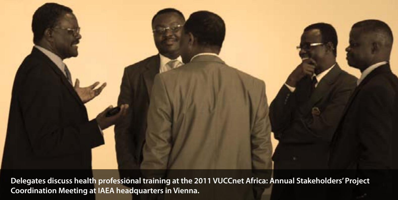
Delegates discuss health professional training at the 2011 VUCCnet Africa: Annual Stakeholders' Project Coordination Meeting at IAEA headquarters in Vienna.